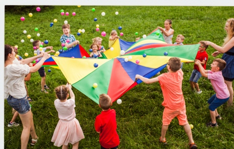
Lots of Games & Sports Fun