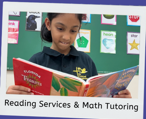
Reading Services & Math Tutoring