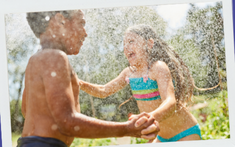
Water Days & MORE...

For More information, contact us : info@conradacademy.org www.conradacademy.org